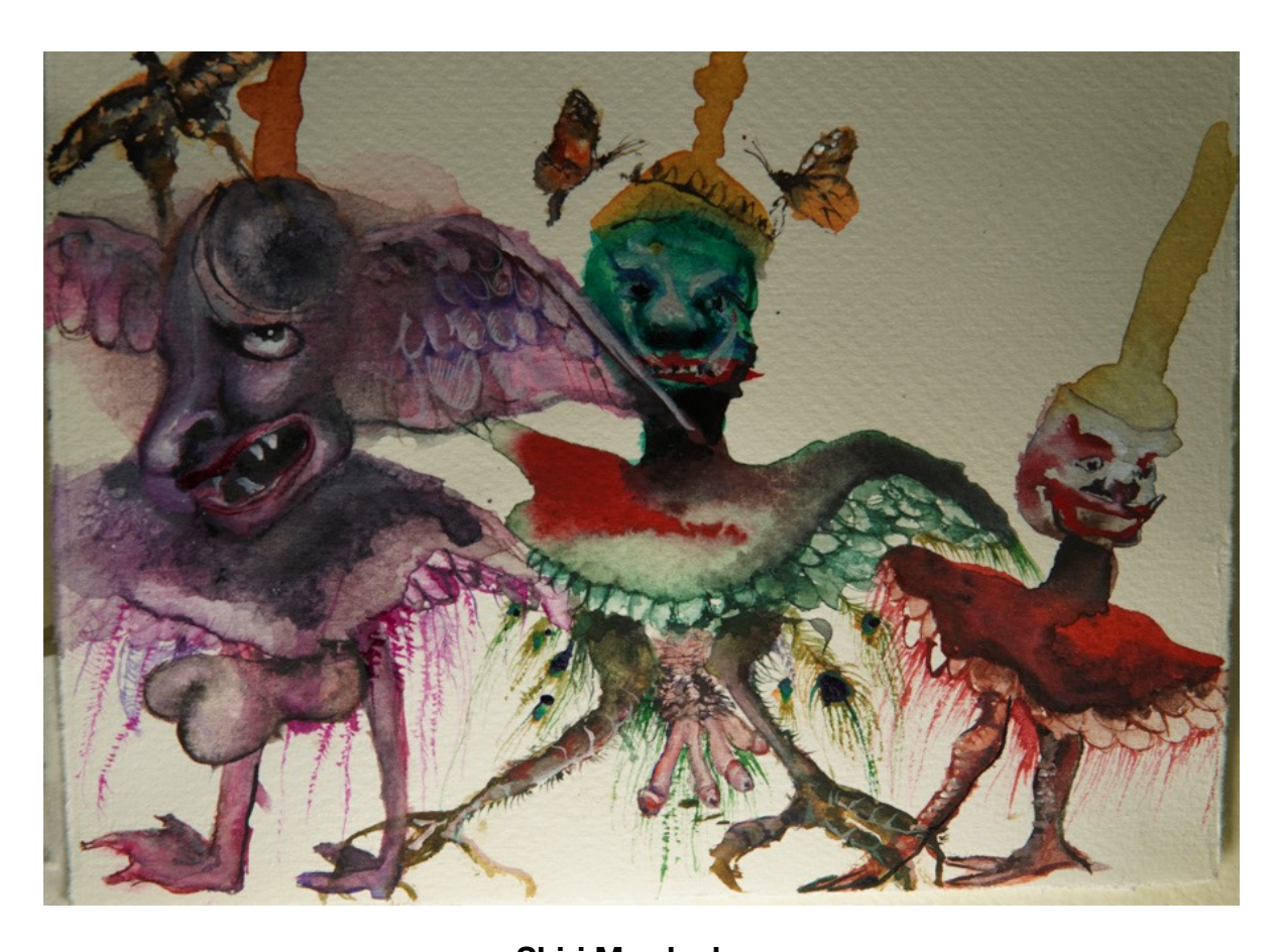
Shiri Mordechay Untitled (Thai demons), 2020 watercolor on paper 6 x 8 inches $800