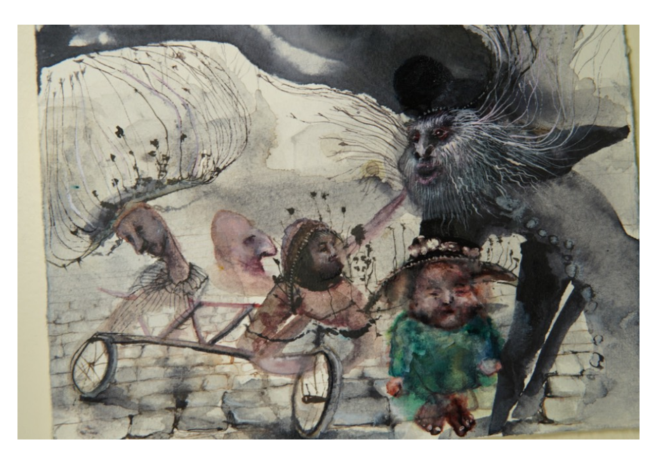
Shiri Mordechay Untitled (children), 2020 watercolor on paper 6 x 8 inches $800