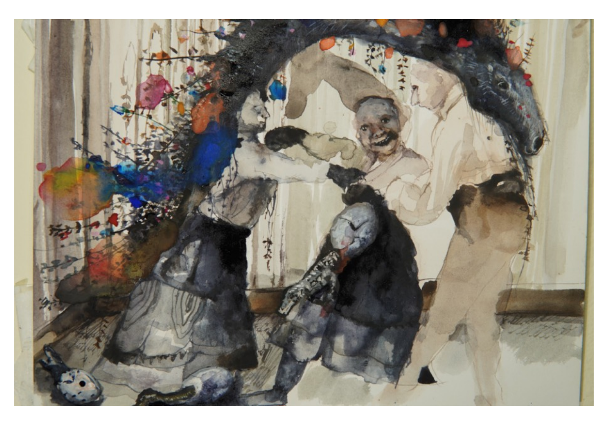
Shiri Mordechay Untitled (rainbow horse), 2020 watercolor on paper 6 x 8 inches $800