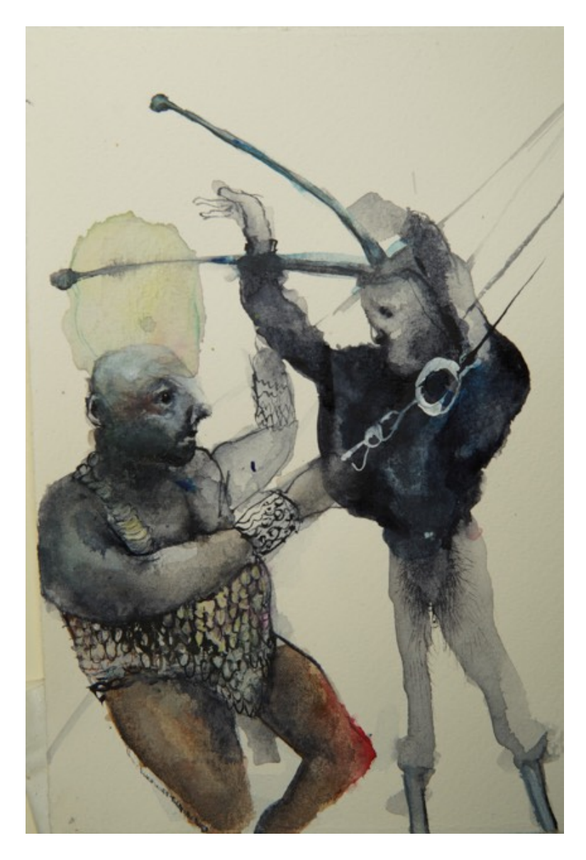
Shiri Mordechay Untitled (snailhead), 2020 watercolor on paper 8 x 6 inches $800