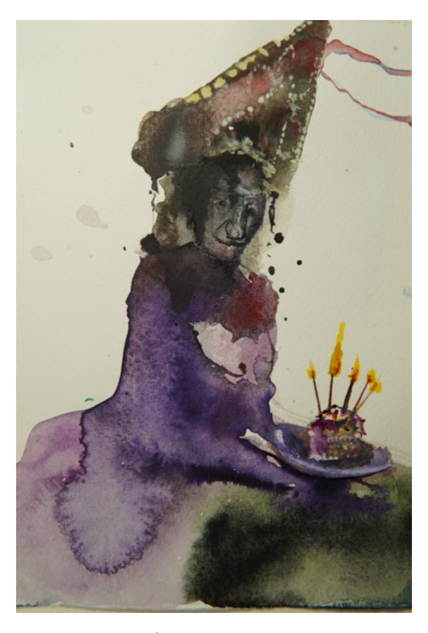
Shiri Mordechay Untitled (birthday candles), 2020 watercolor on paper 8 x 6 inches $800