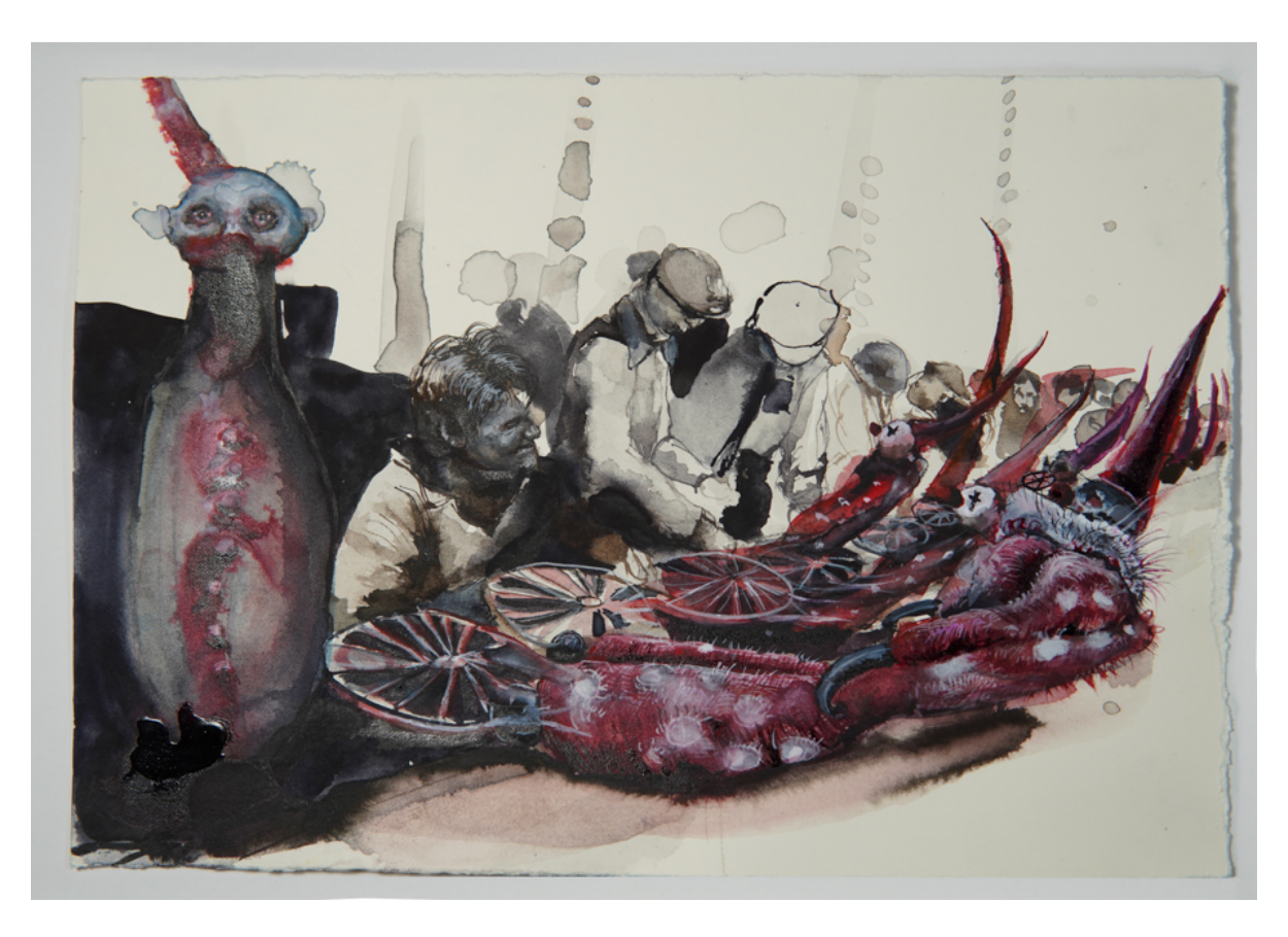
Shiri Mordechay Untitled (clowns), 2020 watercolor on paper 7.5 x 11 inches $1000