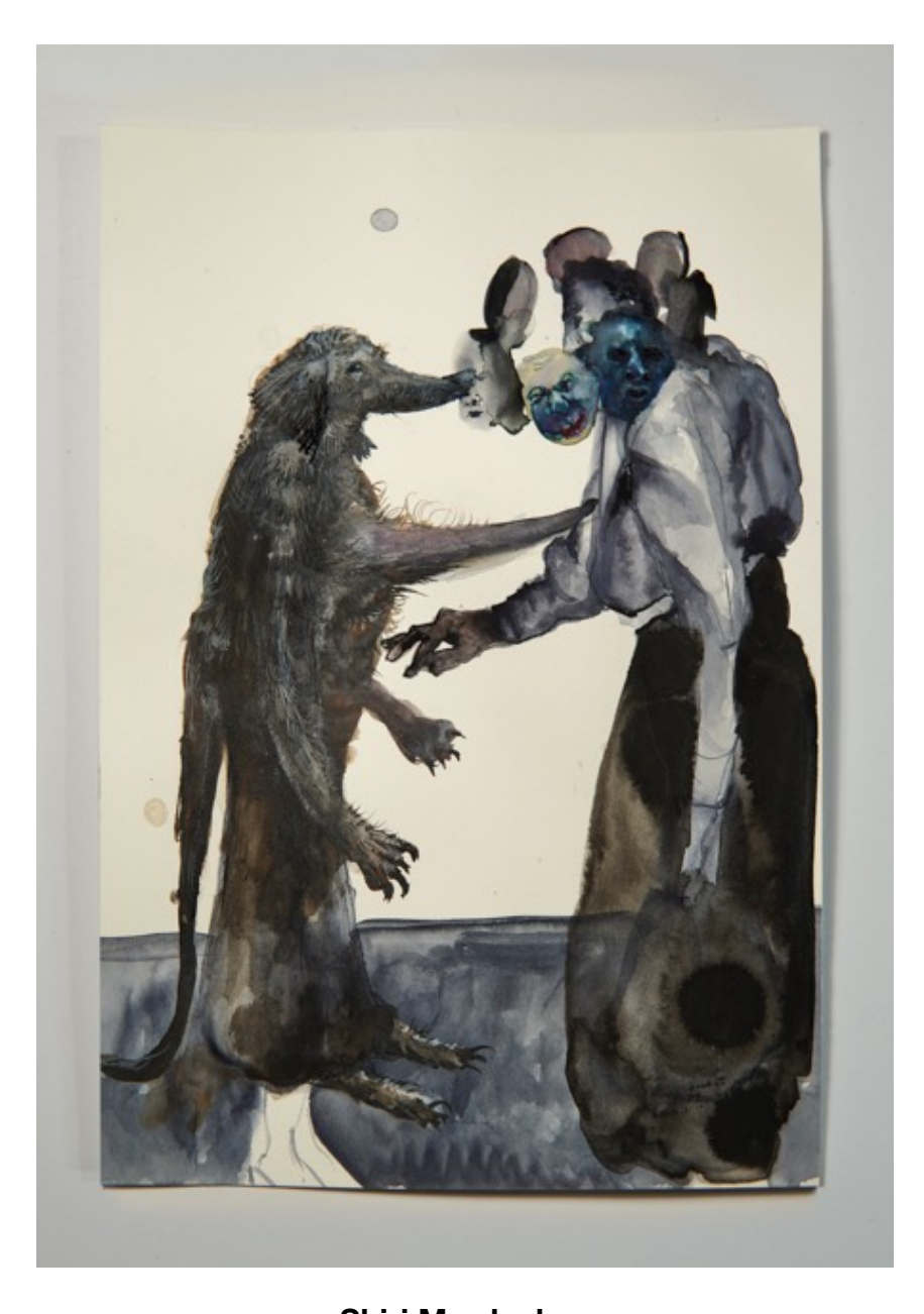
Shiri Mordechay Untitled (dog and mask), 2020 watercolor on paper 10 x 8 inches $950