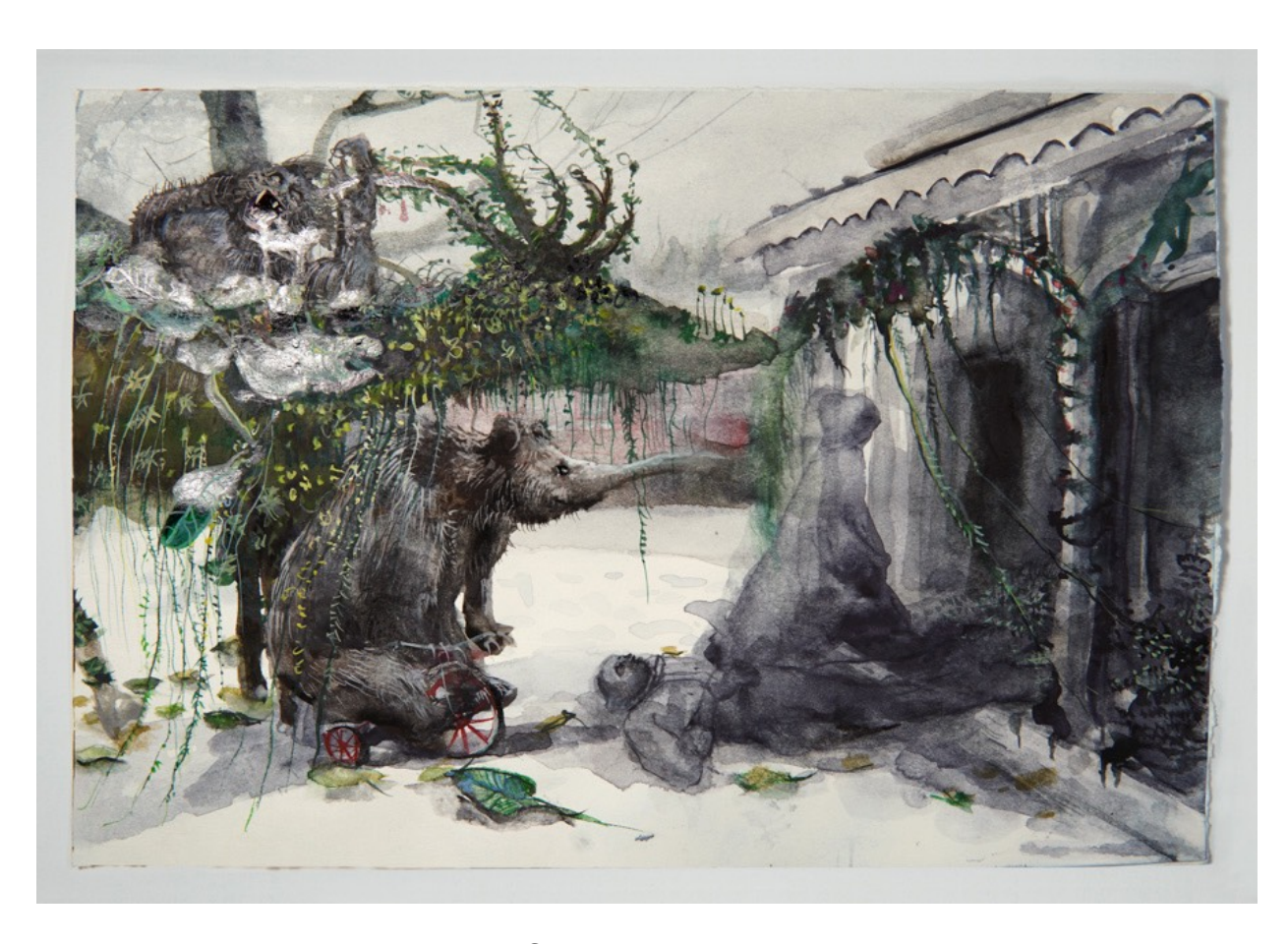
Shiri Mordechay Untitled (snow), 2020 watercolor on paper 7 x 10 inches $900