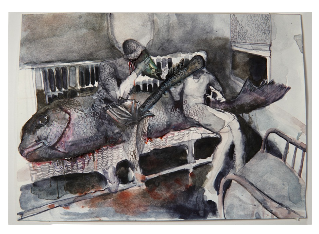
Shiri Mordechay Untitled (fish on sofa), 2020 watercolor on paper 7 x 10 inches $900