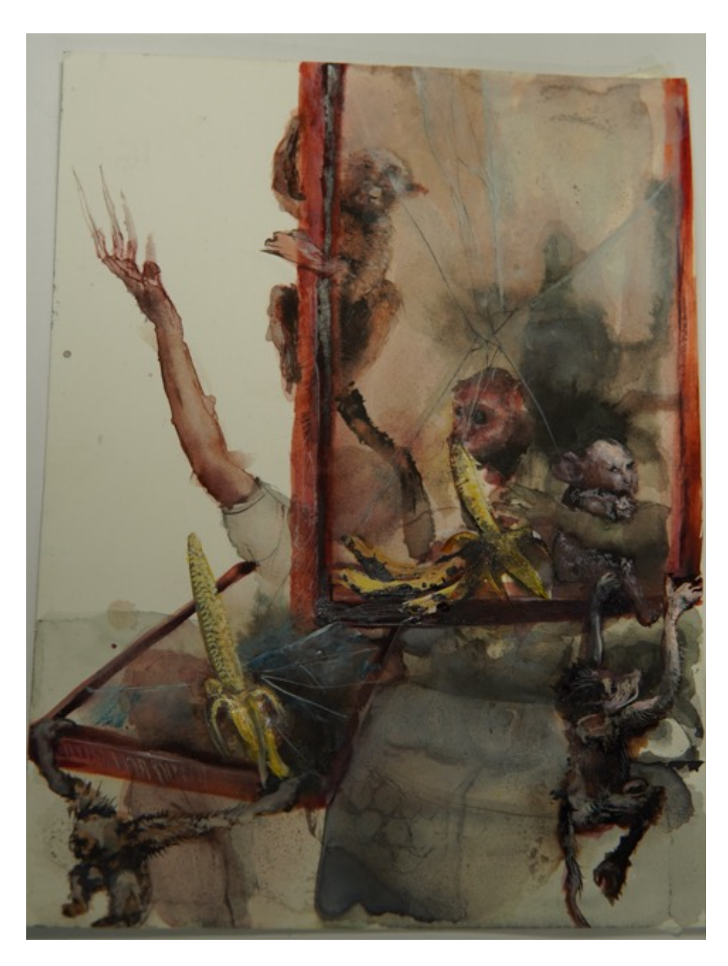
Shiri Mordechay Untitled (broken glass and bananas), 2020 watercolor on paper 8 x 6 inches $800