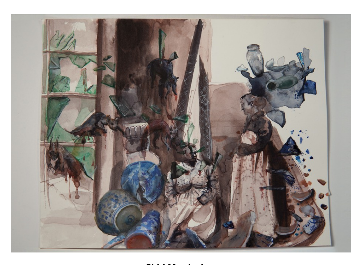
Shiri Mordechay Untitled (broken glass), 2020 watercolor on paper 8 x 10 inches