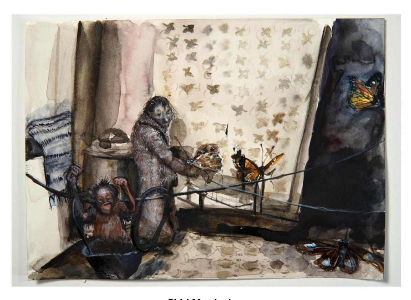
Shiri Mordechay Untitled (old lady and butterfly), 2020 watercolor on paper 6 x 8 inches $800