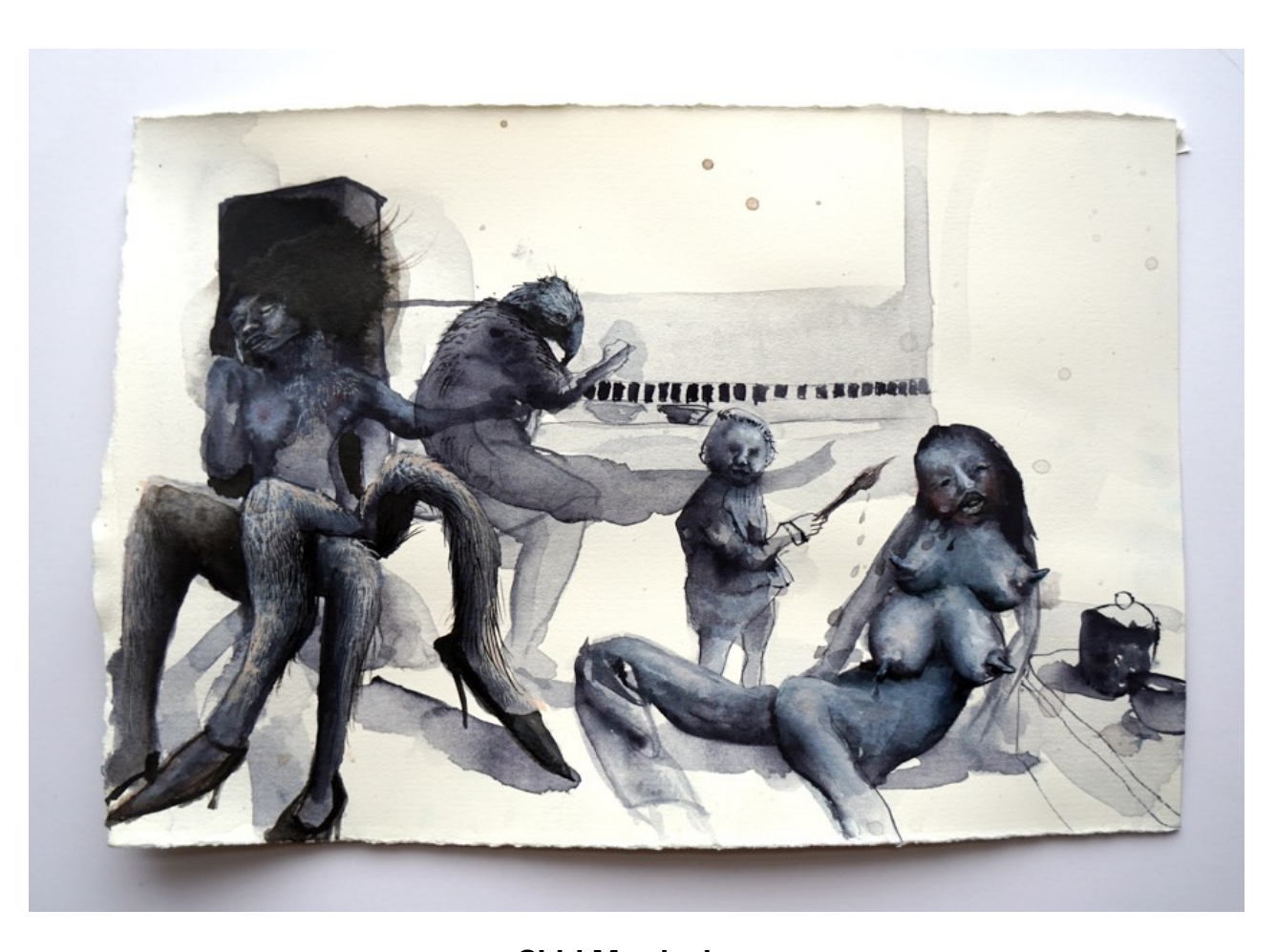
Shiri Mordechay Untitled (artist boy), 2020 watercolor on paper 6 x 8 inches $800