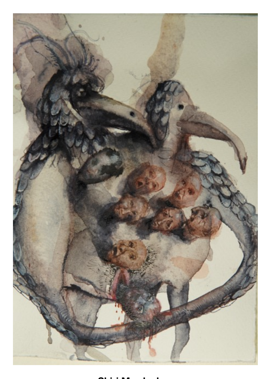
Shiri Mordechay Untitled (birds and heads), 2020 watercolor on paper 8 x 6 inches $800