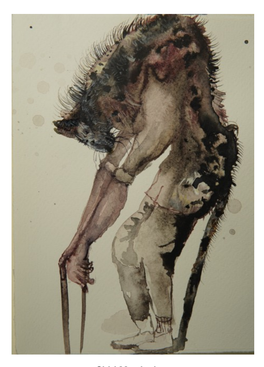
Shiri Mordechay Untitled (hyena), 2020 watercolor on paper 8 x 6 inches $800