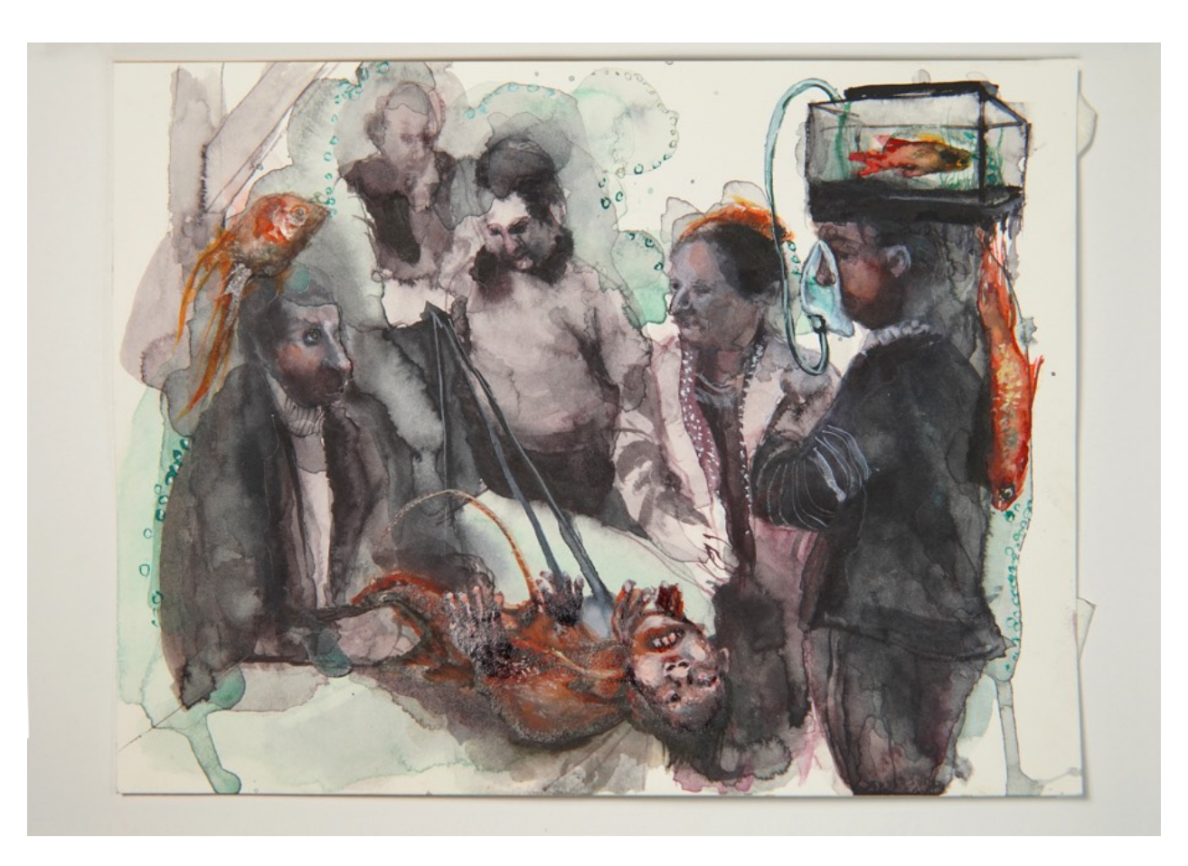
Shiri Mordechay Untitled (aquarium), 2020 watercolor on paper 6 x 8 inches $800