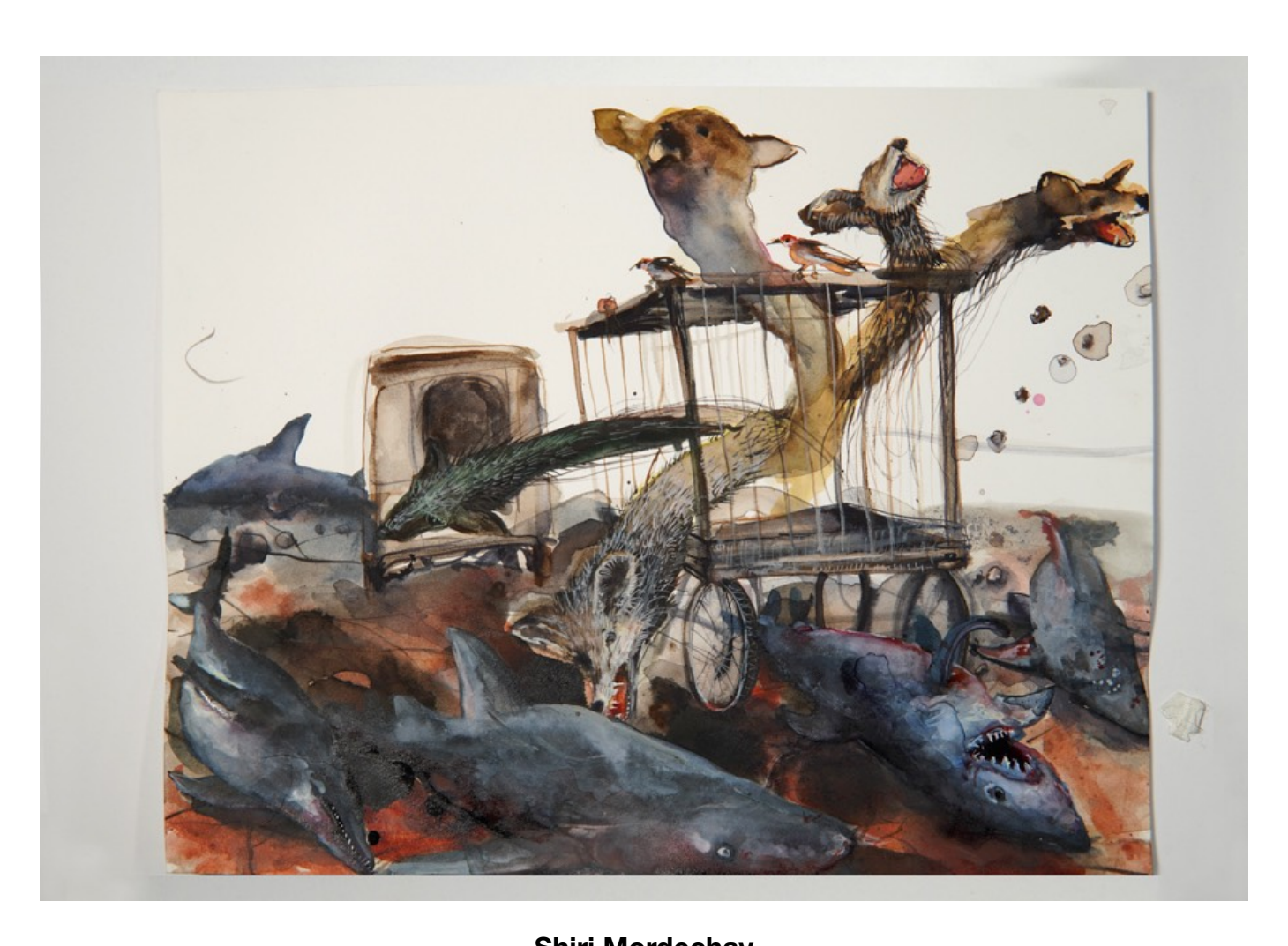
Shiri Mordechay Untitled (fox and sharks), 2020 watercolor on paper