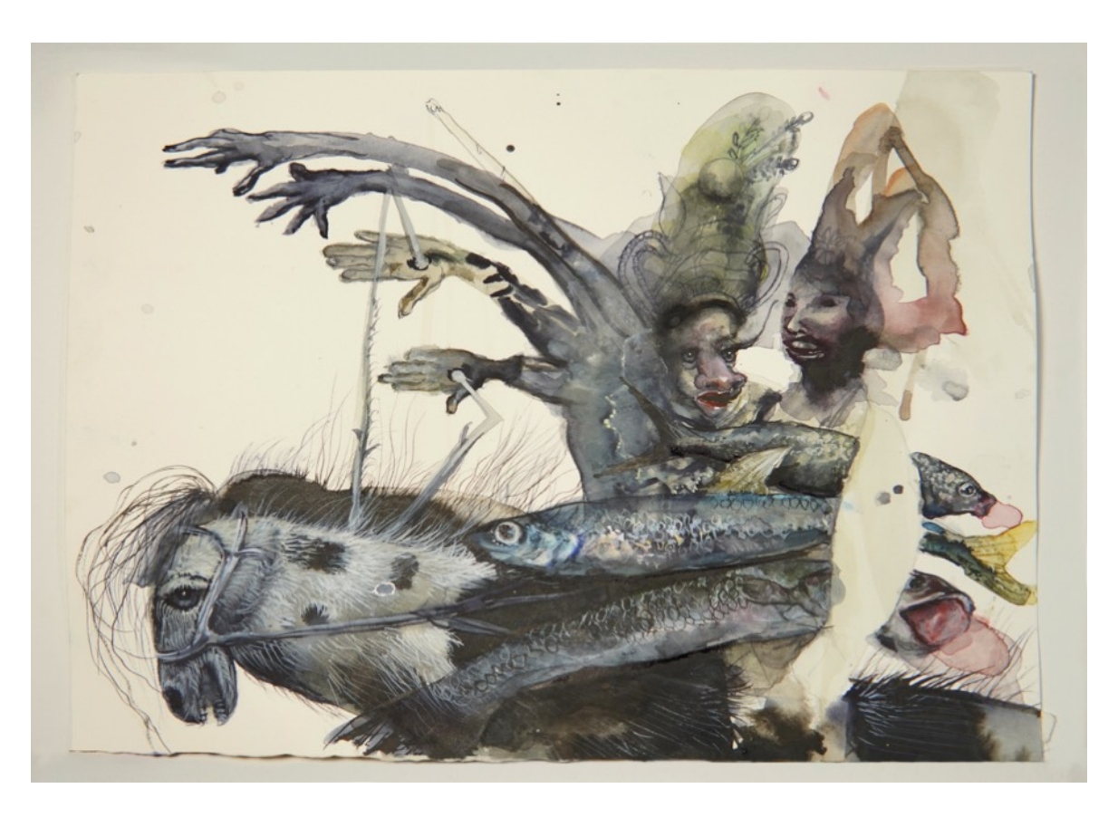
Shiri Mordechay Untitled (marionette), 2020 watercolor on paper 8 x 10 inches $950