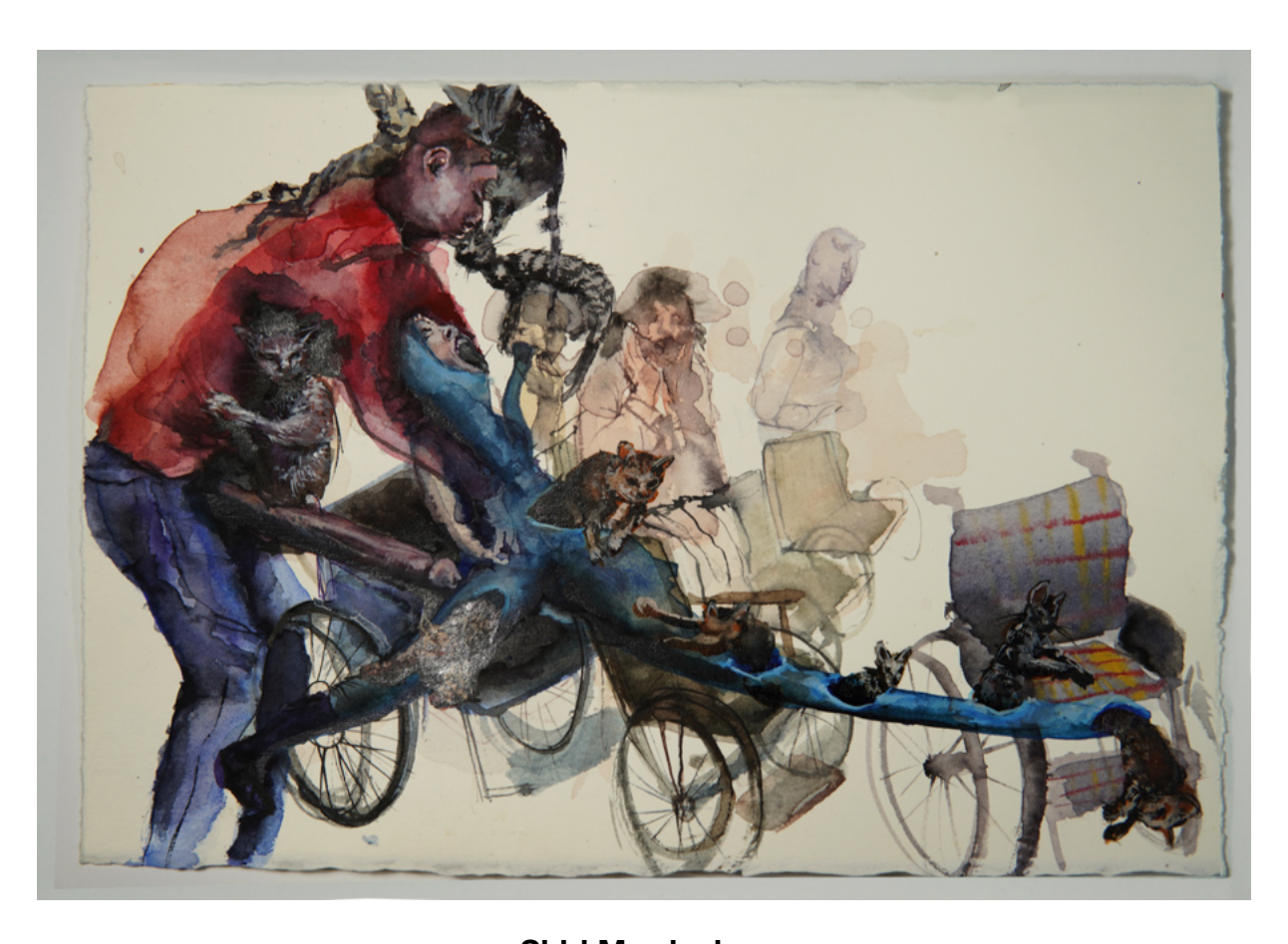
Shiri Mordechay Untitled (wheelchair), 2020 watercolor on paper 7.5 x 11 inches $1000