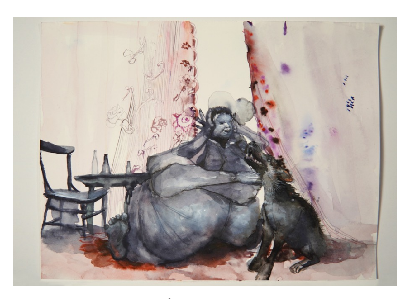
Shiri Mordechay Untitled (dog), 2020 watercolor on paper 8 x 10 inches $950