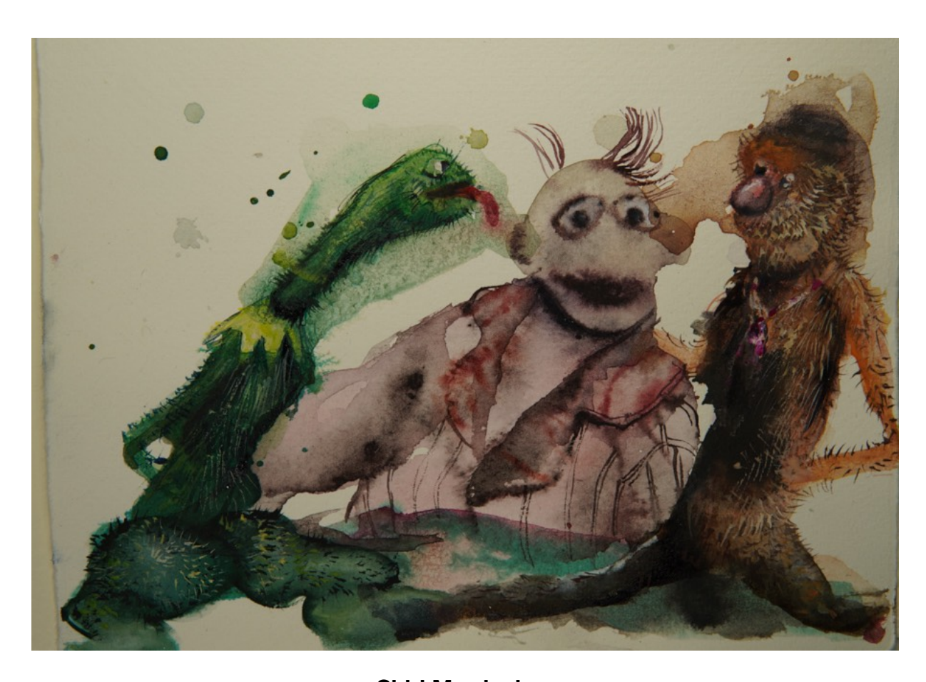
Shiri Mordechay Untitled (Muppet), 2020 watercolor on paper 6 x 8 inches $800