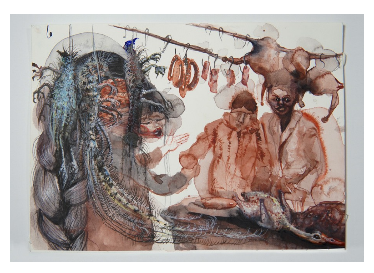
Shiri Mordechay Untitled (meat), 2020 watercolor on paper 6 x 8 inches $800